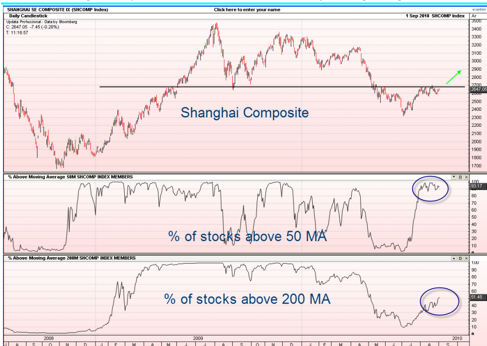
Exhibit 2: Shanghai Comp with % of stocks above 50 and 200 days moving average

Source: Uputa, Daiwa Capital Markets Hong Kong Ltd.