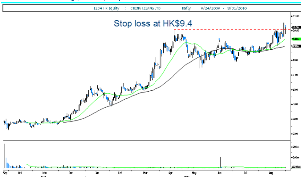
Exhibit 4: China Lilang (1234 HK) daily chart with 20 and 50 MA